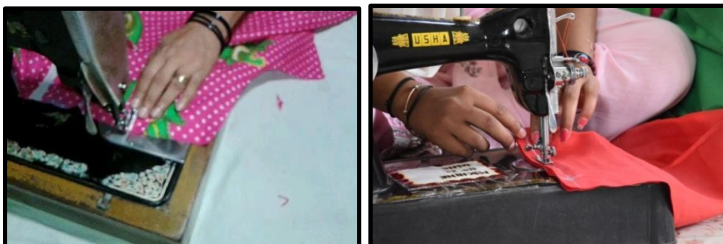
Cutting and sewing